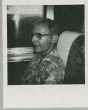
He is from Occoaside and was going to San Francisco. He said that traveling by train helps him to relax.