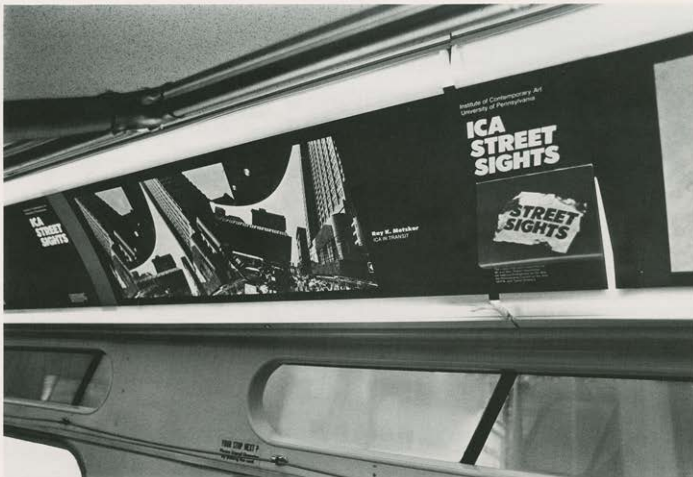
Ray K. Metzker; Street Sights , Institute of Contemporary Art, University of Pennsylvania, Philadelphia, 1980

to the size of a single advertising panel. Each contribution was then reproduced as a serigraph on translucent polystyrene in an edition of 400. All six photographs went to each bus and were randomly distributed among the ads.