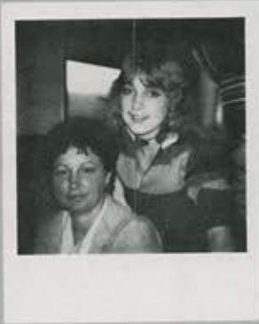
This woman is a builder in Bend, Ore. She was on a holiday with her daughter to Southern California.