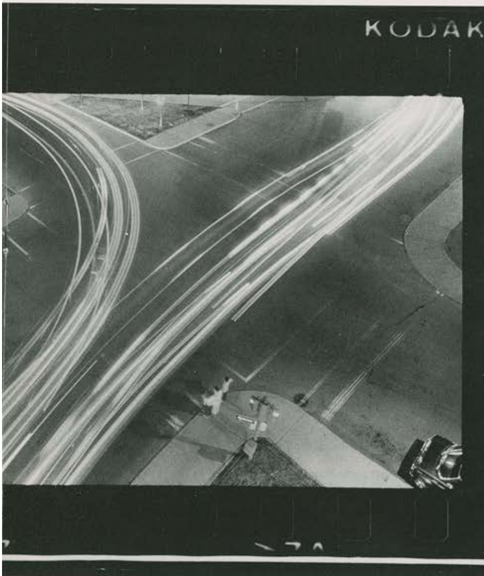
Denis Farley; L'ART EN COMMUN (Bus Show), Optica, Montréal, 1984