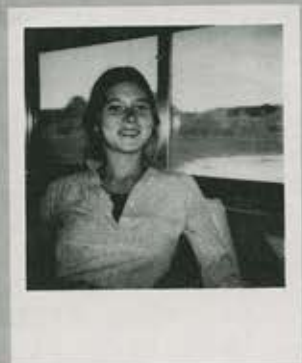
She was returning home after spending the Easter Holiday cross-country skiing near Mount Shasta.