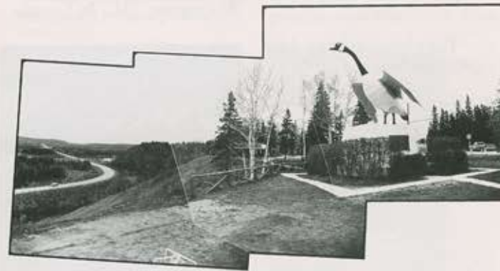
Giant Wawa Goose looks out across the Trans Canada Highway—heading ever westward, Wawa, Ontario, October 8, 1982.