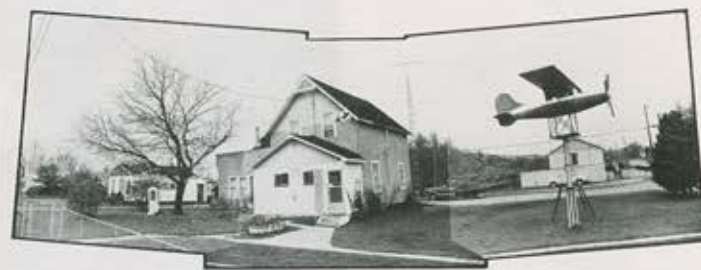
Giant Toy Airplane Whirlygig, McKerrow Post Office and lawn shrine, McKerrow, Ontario, October 9, 1982.